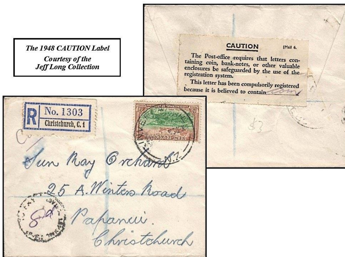
Earliest Known Use of the 1948 CAUTION Label (Type 1 – Bracket and Full Stop) affixed to a letter containing a coin - Postmarked 23 AP 48 in Invercargill