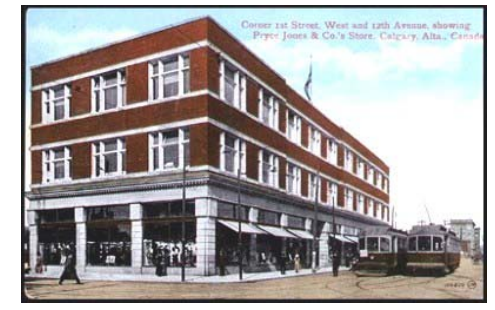
Canadian Army Services Corps Headquarters Military District 13, Calgary, Alberta